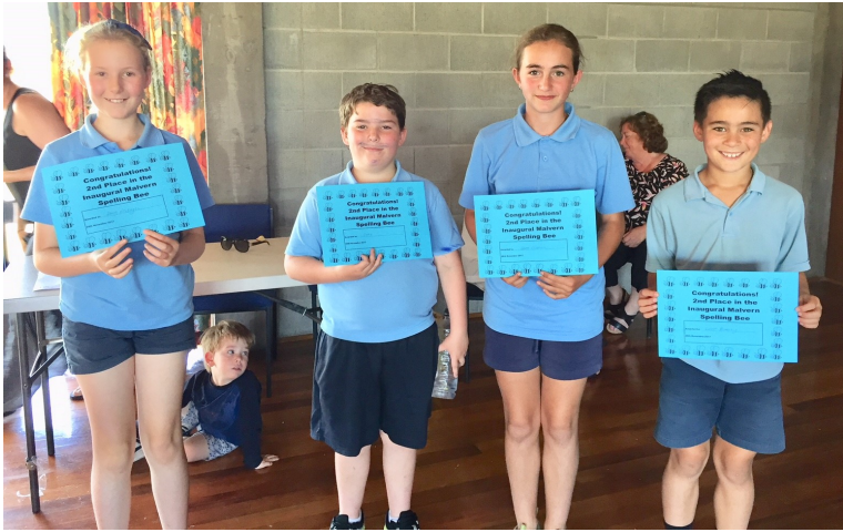
2nd place In the Malvern Spelling Bees