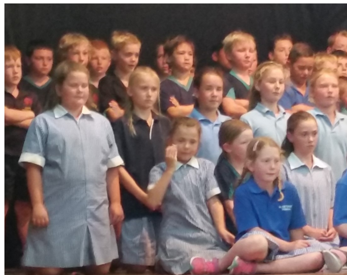
The combined Kapahaka performance